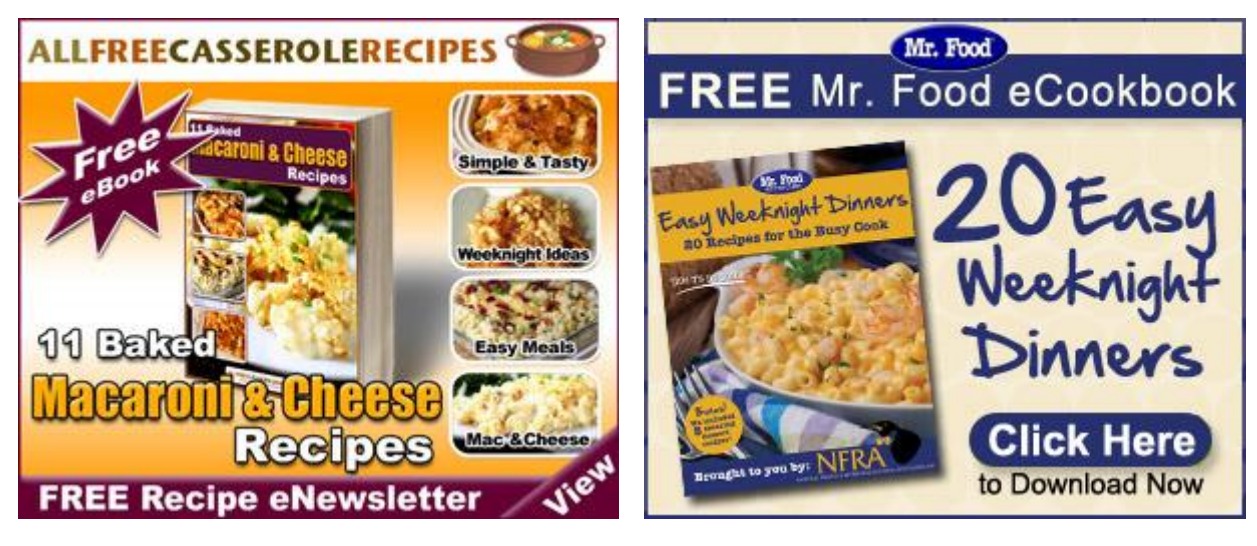
Try 11 Tempting Ways to Cook Mac and Cheese

Dinner Made Simple with 20 Easy Dinner Ideas