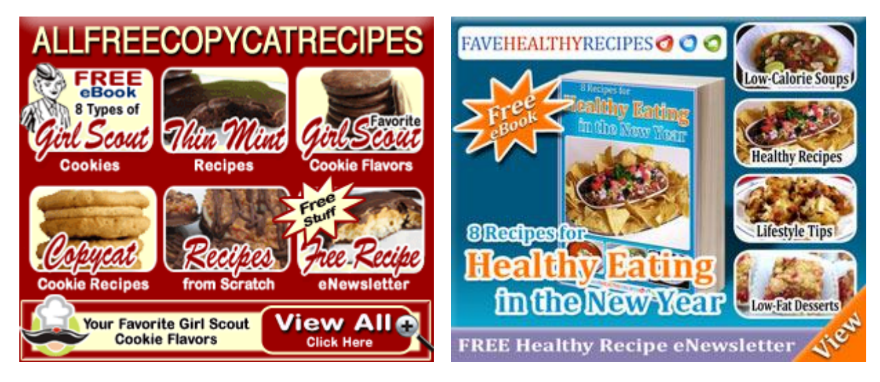
Free Homemade Girl Scout Cookie Recipes