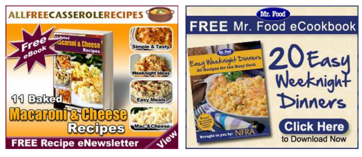
Try 11 Tempting Ways to Cook Mac and Cheese

Dinner Made Simple with 20 Easy Dinner Ideas